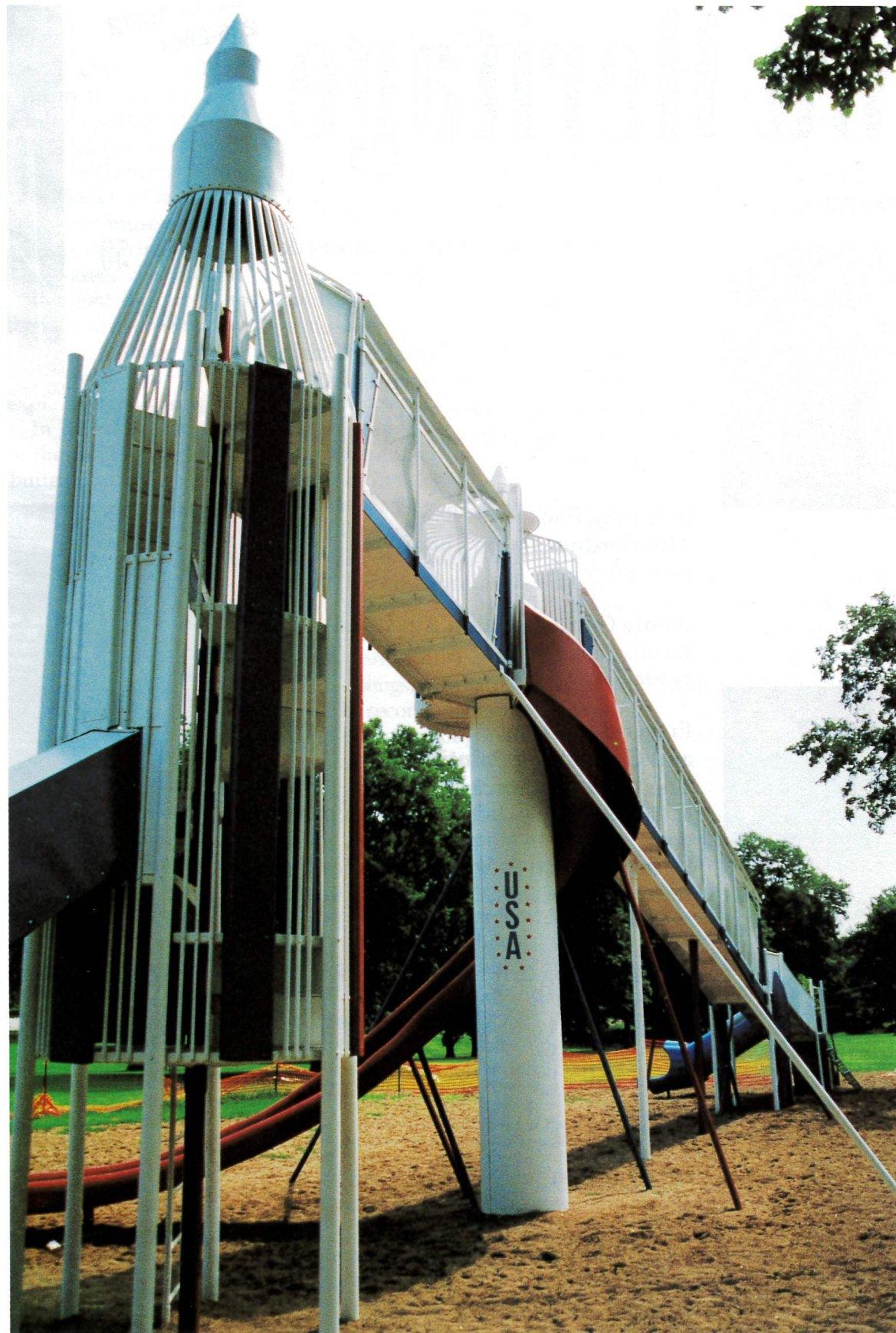
SHS: PHOTO BY ROGER MUNNS