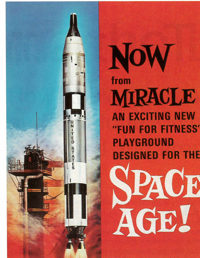
The powerful cover image of a United States rocket launch in one of the company's brochures showcases Miracle's vigorous enthusiasm for space technology's progressive influence.

By early July, the rocket slide sported a fresh coat of paint, new metal mesh fencing along the walkway, and improved traction on its ramp and interior spiral staircase. Its resurrection prompted a grand opening