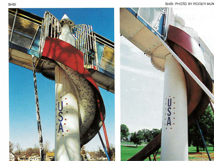
The slide's deterioration (left) was clearly evident before city workers implemented this summer's improvements (right). The slide's new paint job, along with other repairs, has upgraded the Des Moines icon's appearance to one that more capably approximates the dynamic spirit of the product line promoted in Miracle's flagship brochure cover image (top).

ceremony three weeks later. Community activists, including one member of the Kids' Kommittee who showed up wearing a hardhat, helped to cut a 600-foot red ribbon connecting the rocket slide and other playground equipment.